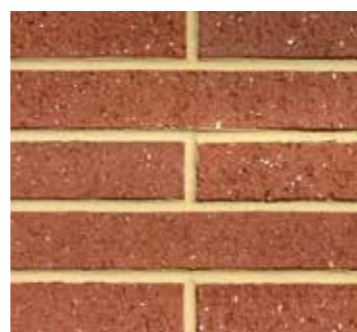
NEW YORK TAN