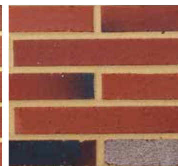
NEW ORLEANS VINTAGE